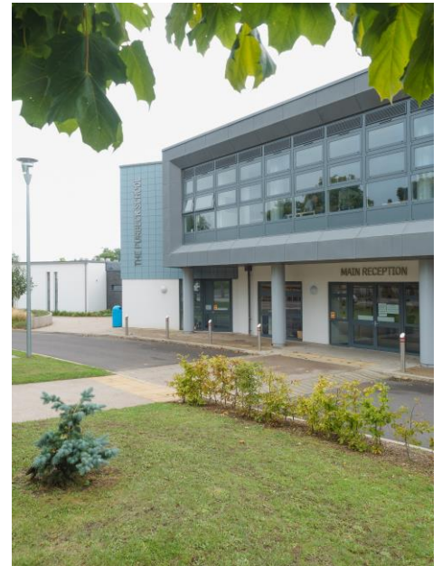
The Purbeck School

The Purbeck School Worgret Road Wareham Dorset BH20 4PF